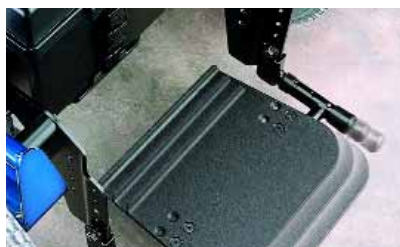
Up to 3" of depth adjustability.

Beautiful high gloss shrouds with color molded into the shrouds complete the look of this innovative and incomparable power wheelchair – the Invacare Excel.